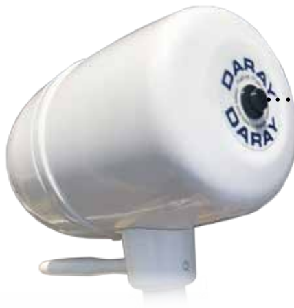
X240 control switch on rear of head