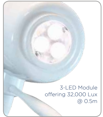
3-LED Module offering 32,000 Lux @ 0.5m