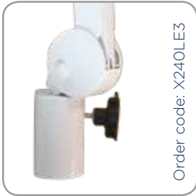
Order code: X240LE3