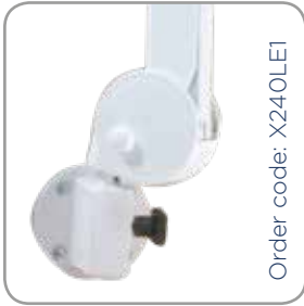
Order code: X240LE1