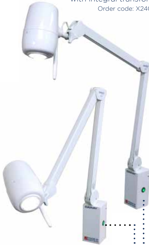
Transformer housed in box at base of neck. Box mounts directly to the wall.