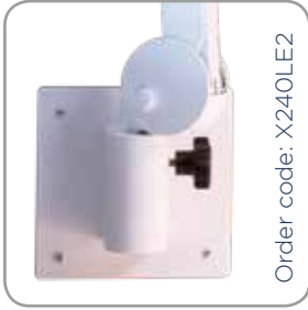
Order code: X240LE2