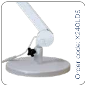
Order code: X240LDS