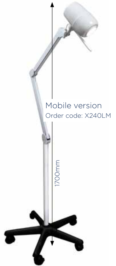
Mobile version Order code: X240LM