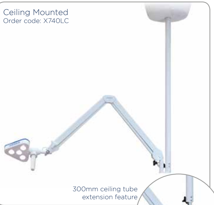
300mm ceiling tube extension feature