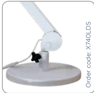
Order code: X740LDS