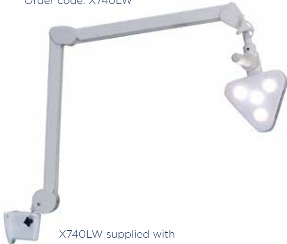
X740LW supplied with plug-top transformer.

Hardwired Wall Mount with integral transformer Order code: X740LE4