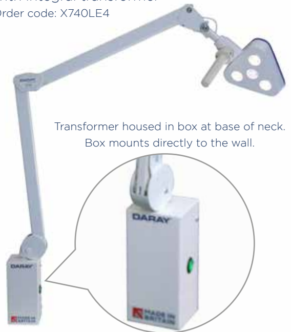
Transformer housed in box at base of neck. Box mounts directly to the wall.

Hardwired Wall Mount with integral transformer Order code: X740LE4