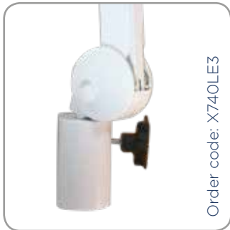
Order code: X740LE3