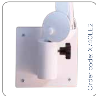
Order code: X740LE2