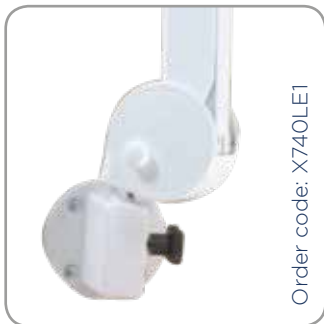
Order code: X740LE1